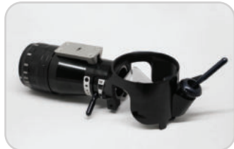
High precision micromanipulators