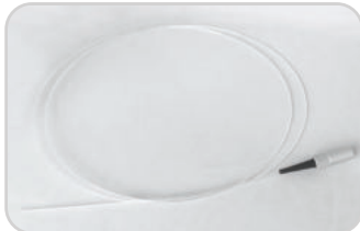
Flexible fibers with pilot beam