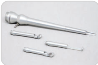
Specialized handpiece sets