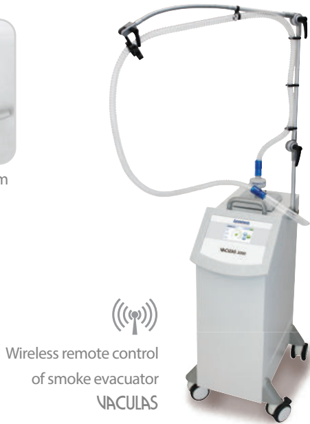
Wireless remote control of smoke evacuator VACULAS