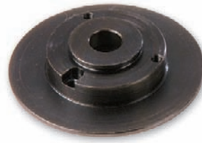
Heavy duty, precision bearing races