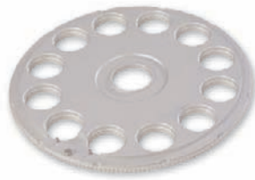
Precision machined, industrial strength aluminum lens dials