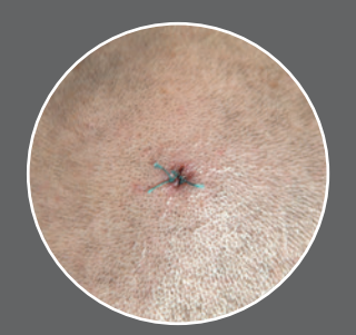
Without light and without magnification