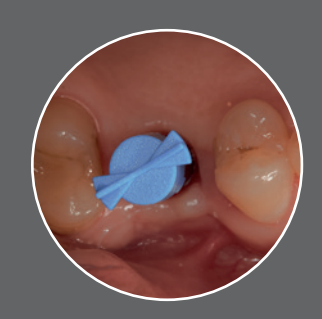
Without light and without magnification